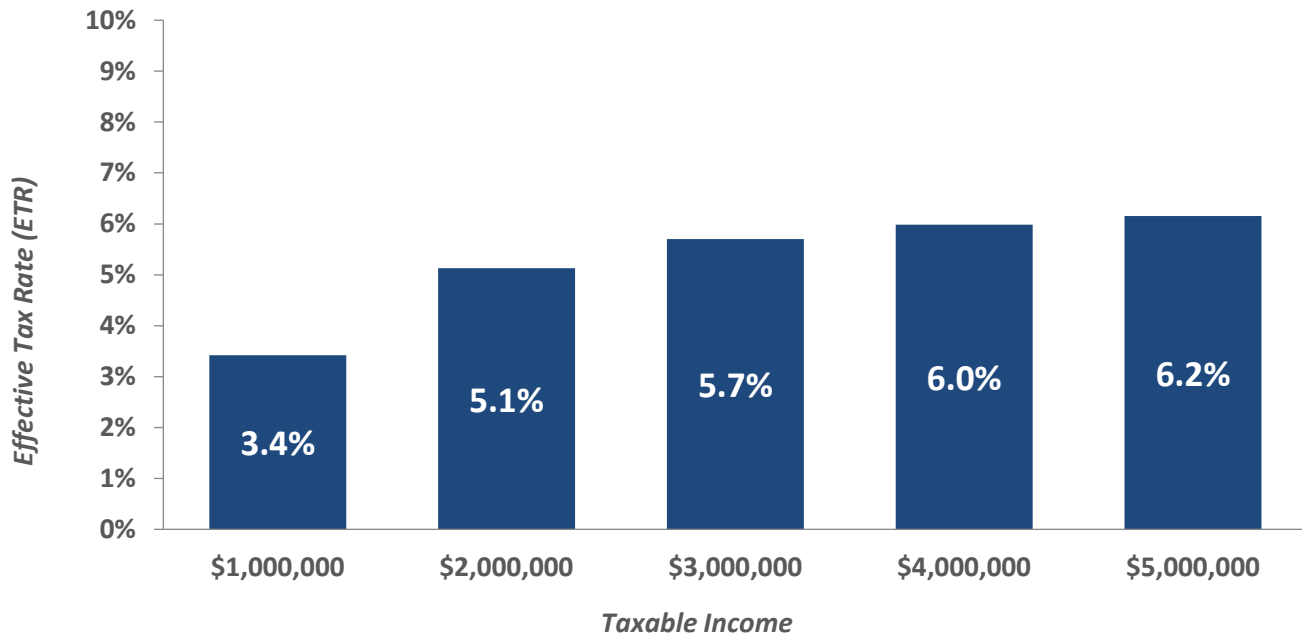
Chart 3: Federal Offset Reduces Effective Tax Rates for High-Income Taxpayers

Note: Effective tax rates are shown for a two-rate income tax with the first $1 million in taxable income taxed at 5 percent and all additional income taxed at 10 percent