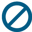
Last minutes changes and cancelations