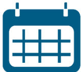
Little advance notice of shifts